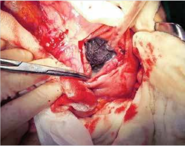
Figure 3. The trichobezoar in the gastric lumen reached via anterior gastrotomy