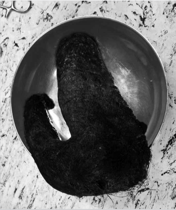
Figure 4. The giant trichobezoar in the shape of the stomach

the management of bezoars. Endoscopic treatment options involving the removal of gastric trichobezoars after crumbling them by baskets, snare, and lithotripter forceps have been unsuccessful (10). Phytobezoars, on the other hand, can be treated medically with motility stimulating, enzymatic, pro-kinetic, and mucolytic agents as well as endoscopically by fragmenting them with snares and forceps.