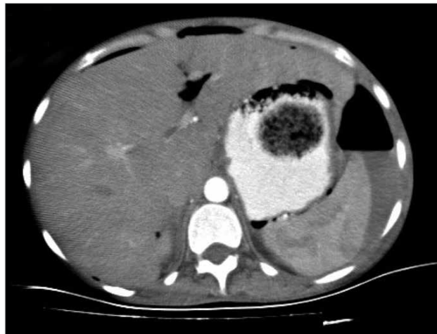
Figure 1. A giant mass that fills the lumen of the stomach with abscess formation between the stomach and spleen

Trichobezoars are formed by oral ingestion of mostly human hair and rarely animal fur and/or wool and filaments from furniture (6). However, the mechanism for the formation of trichobezoars is obscure. According to the most popular hypothesis, bezoars originate from strands of hair in the gastric folds combining with mucus and food particles and growing in size. However, this hypothesis fails to explain why hair strands hold on to the stomach in the first place (7). Trichobezoars are usually found in young female patients with mental retardation and/or psychiatric disorders such as trichotillomania or trichophagia. Trichobezoars are usually accompanied by psychiatric disorders such as obsessive compulsive personality disorder, pica, anorexia nervosa, or as in our case, depressive behavioral disorder.