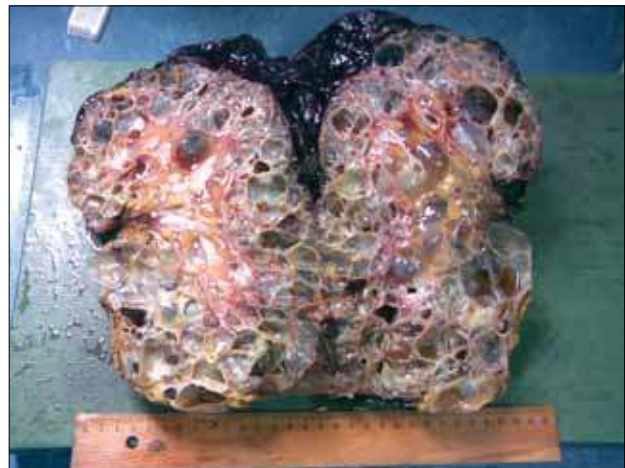
Figure 2. Macroscopic view of a section of the specimen