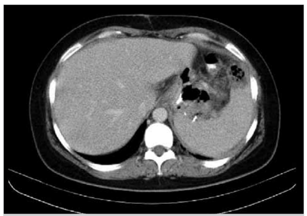
Figure 1. Computed tomography view of the patient after suspicion of leakage

The clinical picture may be very different in these cases. They can remain completely asymptomatic, or present with symptoms such as fever, epigastric pain, tachycardia, leukocytosis, and restlessness. Physical examination findings are not clear. The most important factor in diagnosis is the surgeon's ex-