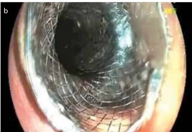
Figure 4. Fluoroscopic view of the stent (a). Endoscopic view of the stent (b)