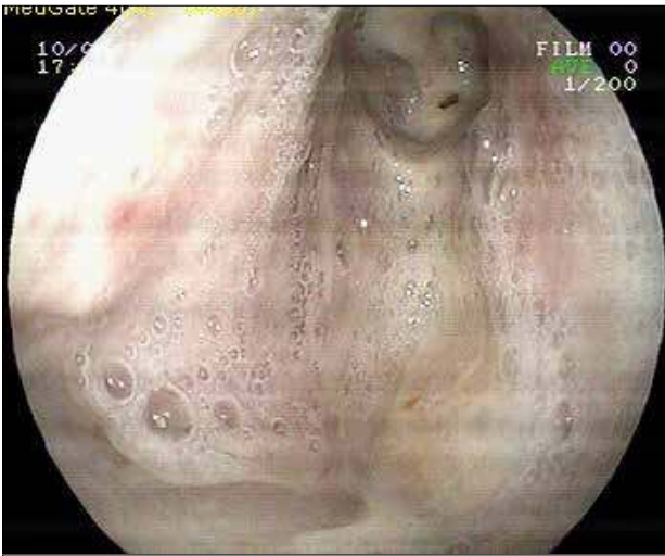
Figure 3. Endoscopic view on postoperative 6 th day