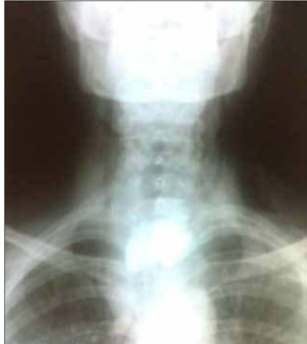
Figure 2. Cervical involvement on contrast X-ray

There are not many clinical examination findings. Pharyngeal pouches can be diagnosed easily by using barium x-rays that indicate the margins of the pouch very well. Barium x-rays