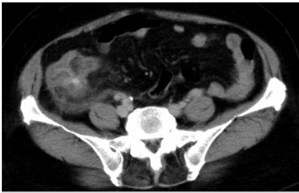
Figure 1. Cecal wall thickening on abdominal tomography