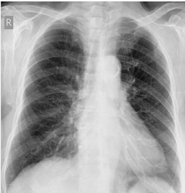
Figure 2. There was no abnormal finding on the posteroanterior chest X-ray