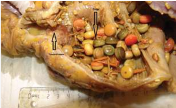
Figure 2. Drugs and tumoral mass that led to obstruction and a proximal pharmacobezoar

metastasis, and an appendix with normal mucosa. Thus, the tumor grade was reported as being pT4N1. There were no malignant cells in the abdominal fluid.