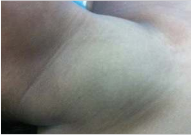
Figure 1. Preoperative view of the patient