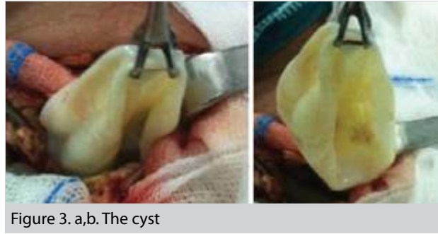
Figure 3. a,b. The cyst

on, latex agglutination, ELISA and immune electrophoresis. In our case, an indirect hemagglutination test was conducted and the result was found to be positive. Even though they may result in false positive or false negative results, serological tests are used commonly to verify the diagnosis (9). The imaging methods are more sensitive than serological tests especially in unusual cyst locations, and identification of germinative membranes or germinal vesicles while serological tests are negative should be assessed in favour of echinococcosis. Since there are no effective medical treatments available, the most efficient treatment for hydatid cyst remains to be surgical excision. The aim of surgery is to prevent the spread of its contents and to remove the cyst in its entirety. If surgical treatment is not possible due to the patient's overall condition, treatment with mebendazole or albendazole, that are associated with unpredictable results and side effects, may be attempted. A long-term follow-up is required (10). Anti-parasitic medications seem to play a role in eliminating live parasites and in preventing contamination by cyst contents during surgery, rather than ensuring a full recovery. Treatment of hydatid cyst of the thyroid is excision, as is the case for all hydatid cysts in the body (11). In our case, we performed bilateral total thyroidectomy. No complications developed following surgery.