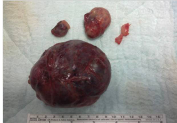
Figure 3. Macroscopic view of the excised giant fibroadenoma specimen