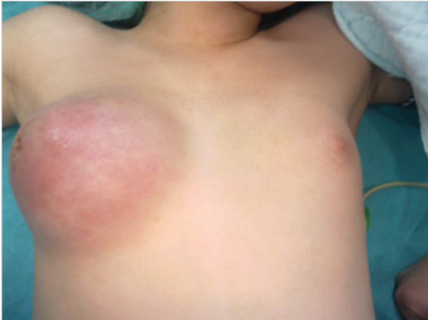
Figure 1. Preoperative view of the patient