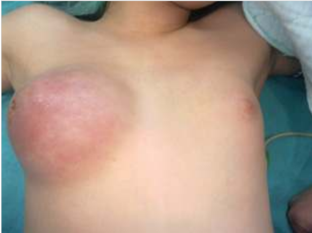
Figure 1. Preoperative view of the patient