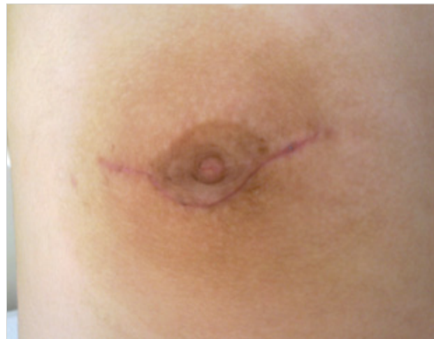
Figure 4. Postoperative view at the 6 th month

Juvenile giant fibroadenomas can influence mammary gland development by the pressure effect due to their enormous