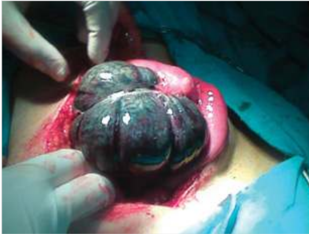
Figure 1. Cecal volvulus with gangrene