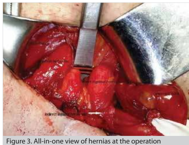
Figure 3. All-in-one view of hernias at the operation

technique can be performed with or without mesh. Primary repair can be considered for small defects, however mesh repair is appeared to be more appropriate in cases of wide defect or atrophic aponeurosis (6). In addition, open surgery is the most frequent procedure done in cases of emergency surgery (5). In our case, Spigelian defect was smaller than 2 cm, but both Spigelian area and inguinal region were weak, and thus use of prosthesis was preferred for hernia repair. In addition, lower lo-