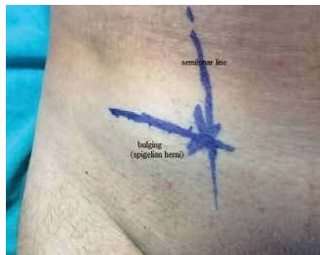
Figure 2. A bulging can be seen next to the rectus muscle. It appears especially during coughing and standing