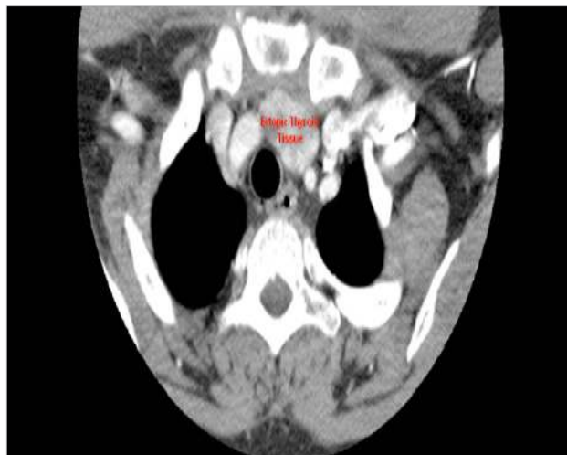
Figure 1. Image of CT-scan CT: computed tomography

Substernal goiter is the extension of thyroid gland in the mediastinum. If the thyroid tissue extends towards mediastinum it is defined as secondary and If there is ectopic thyroid gland in the mediastinum it is defined as primary. Primary substernal goiter constitutes 1% of all substernal goiters. Primary and secondary substernal goiters are fed respectively by mediastinal vessels and the vessels in the neck (5). Therefore, for the patients to be operated for substernal goiter, the differentiation of primary and secondary is clinically important. Ectopic thyroid tissue: anatomical, clinical, and surgical implications of a rare entity. In the literature there are very few cases related to mediastinal thyroid tissue detected after thyroidectomy, except the ones reported by Sahbaz et al. (6), Calò et al. (4) and Casadei et al. (7). Therefore, no incidence was reported in the literature regarding mediastinal thyroid tissue detected after thyroidectomy. However, retrosternal goiter incidence rates range between 0.2% and 45% of all goiters, depending on the definition used. About 20-40% of retrosternal goiters are symptomatic (6). Respiratory symptoms and rarely dysphagia or vena cava superior syndrome may be seen in some cases (2). No symptoms associated with retrosternal ectopic thyroid tissue were present in the patient in this case report. Retrosternal ectopic thyroid tissue was determined when there was no increase in TSH level