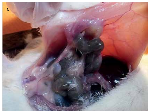
Figure 1. a-c. Macroscopic appearance of tissues. Control group: Intermediate increase adhesion is observed (a), Saline group: Intermediate increase adhesion is observed (b), Mesenchymal stem cell group: Increased adhesion is observed (c)