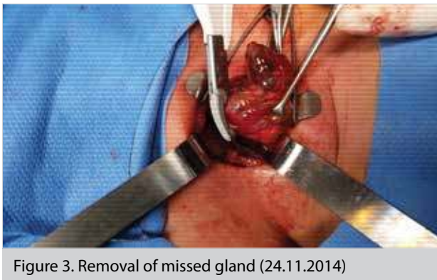
Figure 3. Removal of missed gland (24.11.2014)

unrecognized mediastinal goiter, which is not connected to the thyroid (4). The most frequent recurrence areas that are associated with embryologic location after total thyroidectomy also stand out as anatomical problems. These are pyramidal lobe and thyrothymic and zuckerkindl remnants (3).