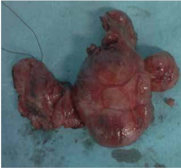
Figure 1. Total thyroidectomy (20.12.2012)