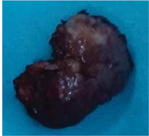
Figure 4. The specimen of missed gland (24.11.2014)