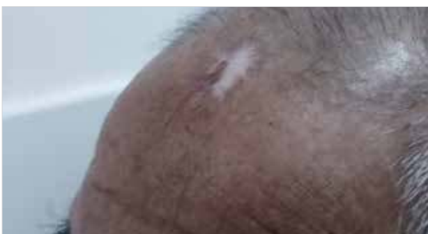
Figure 4. Complete response of the metastatic cutaneous nodule

cancer account for nearly 5%, metastases on the face, scalp, and forehead, as seen in this case, are very rare (7). Atalay et al. (8) reported a case series of 8 patients from 263 colorectal cancer patients in 2009. According to this report and other previous reports, if a primary tumor has been previously diagnosed and treated, the onset to the development of cutaneous metastases usually occurs in the first two years (3). This is considered stage IV disease and usually has a poor prognosis.