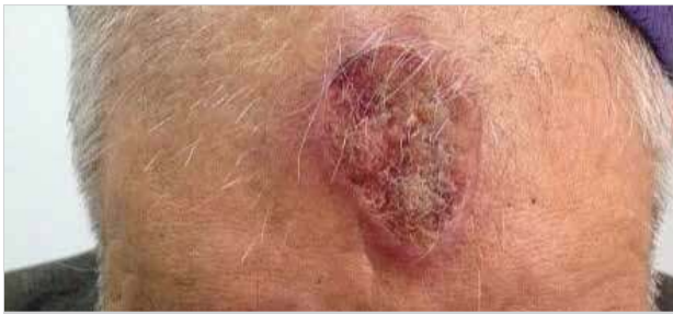
Figure 1. Nodular mass on the forehead