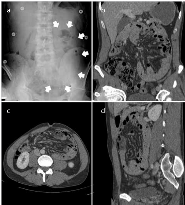
Figure 1. a-d. Radiologic findings in this case (a) A plain radiograph of the abdomen shows a mass-like lesion (arrows). Computerized tomography scan of the abdomen in coronal (b), axial (c) and sagittal (d) cuts