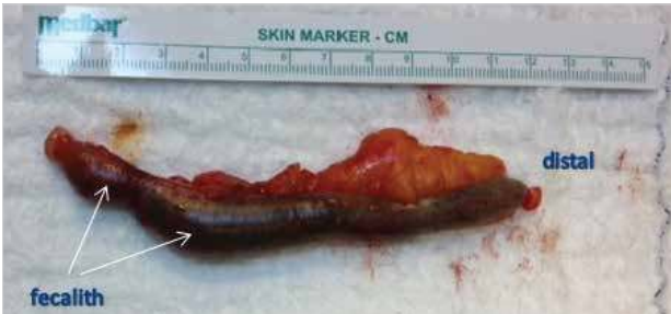
Figure 2. The intraoperative findings revealed acute appendicitis; lumen of the appendix was filled with fecal material

Acute appendicitis postcolonoscopy is an extremely rare occurrence. Appendicitis after colonoscopy was first reported by Houghton and Aston; there are only 12 such cases reported in the medical literature so far (2). Three cases were reported by Vender et al. (3) from two centers with a total volume of 8000 colonoscopies, thus indicating an appendicitis incidence of around 0.038%. This figure is well below that of other complications of colonoscopy, including hemorrhage (0.21%), colonic perforation (0.1%), or abdominal pain (0.09%). However, unfortunately, acute appendicitis is mostly missed because abdominal pain is a common finding after colonoscopy, mostly due to retained gas or colonic spasm after the procedure (1).