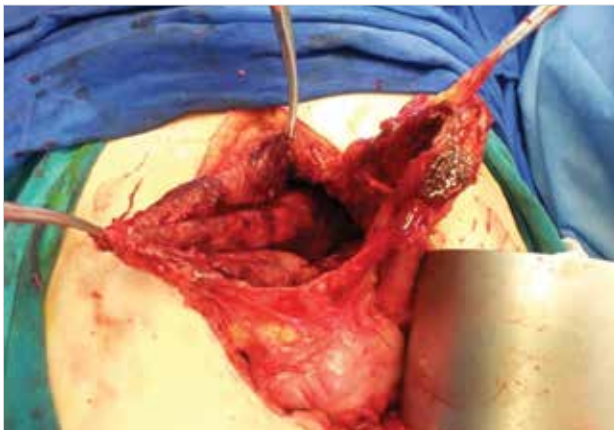
Figure 2. Cavity of the pseudocyst