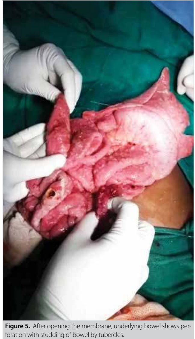
Figure 5. After opening the membrane, underlying bowel shows perforation with studding of bowel by tubercles.

In the post-operative period, among patients with AIO, two patients developed surgical site infection (SSI) managed with