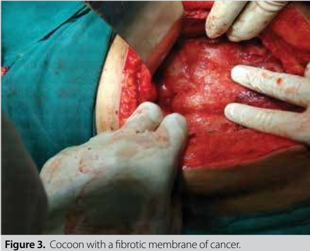
Figure 3. Cocoon with a fibrotic membrane of cancer.