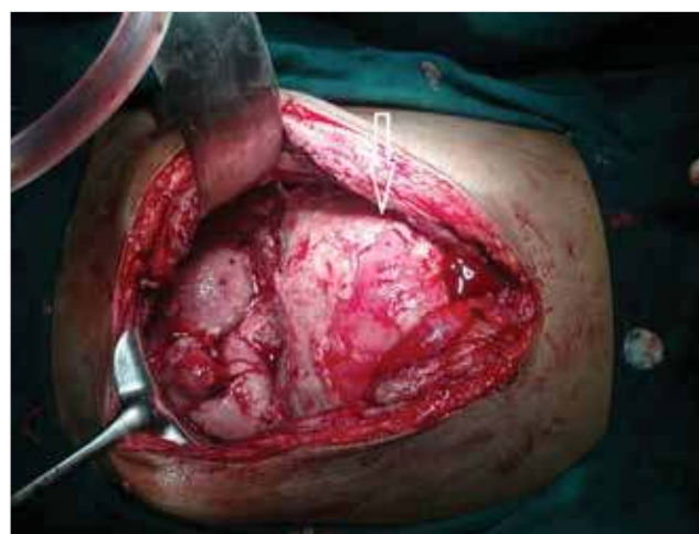
Figure 2. Plastered cocoon in a patient with peritonitis (arrow).

tient in this group presented with the same abdominal finding of plastered cocoon, an ileostomy was done in this patient and few bits of tissue from the adhesions were sent for biopsy which revealed carcinoma (Figures 3 and 4), immunohistochemistry (IHC) of which was suggestive of possible origin from gastro-intestinal (GI) tract or peritoneum. In the 3 rd patient, after sepa-