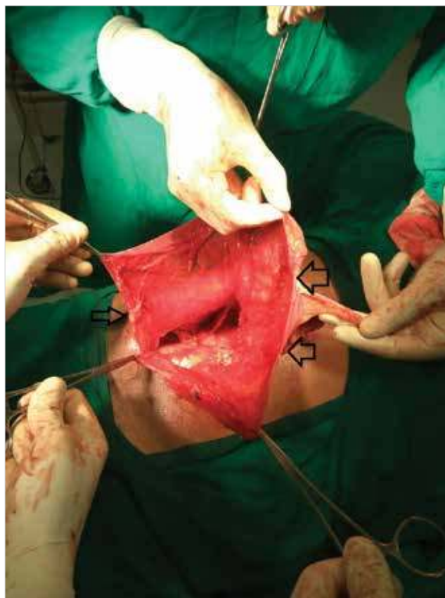
Figure 1. Encapsulating membrane opened (arrows) with underlying bowel.

In two patients of PP, in contrast, the membrane was not delineable and instead a plastered cemented layer (Figure 2) was covering the whole of the bowel. In one patient, iatrogenic injury occurred while dissecting and with much difficulty the site of injury was brought out as a double barrel stoma. Another peculiar thing in this patient was that the mesentery was virtually non-existent and only small sub-millimetric vessels arising from within the cocoon supplied the bowel with the mesenteric fat totally resorbed into the inflammatory process. Another pa-