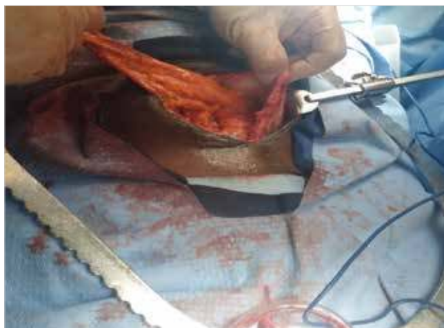
Figure 4. Creation of the peritoneal window. The peritoneum is incised along the length of the incision.