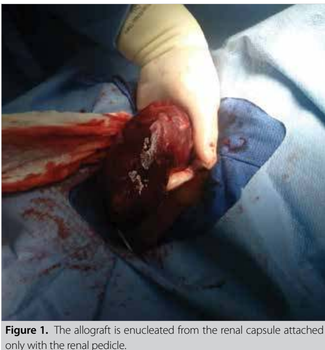
Figure 1. The allograft is enucleated from the renal capsule attached only with the renal pedicle.

From July 2009 to July 2014, a total of 38 transplant nephrectomies using the intraperitoneal window technique were performed by two transplant surgeons at Medstar Georgetown Transplant Institute. IRB approval was obtained. Inclusion criteria for the study was any adult patient with prior kidney transplant undergoing transplant nephrectomy. Patient data was collected