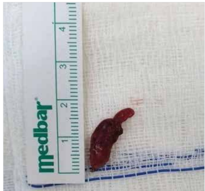
Figure 2. Parathyroid adenoma, 1.6 cm in size.

A 36-year-old pregnant woman (G3P2) who was at the 24 th week of gestation was referred to our department due to elevated serum calcium level which was detected in regular outpatient visit. The patient denied any history of previous disease, operation and family history of chronic diseases. Physical examination was unremarkable. Laboratory tests revealed hypercalcemia with a serum calcium level of 12.4 mg/dL (reference range= 8.5-10.5 mg/dL) and phosphorus of 2.3 mg/dL (reference range= 2.5-4.5 mg/dL). PTH level was found as 286 pg/mL (reference range= 18-78 pg/mL) and 24h urinary calcium as 340 mg (reference range= 100-150 mg). Neck USG showed a solitary parathyroid adenoma 2.1 cm in diameter at the inferior margin of the right thyroid lobe (Figure 3). After oral and intravenous rehydration without forced