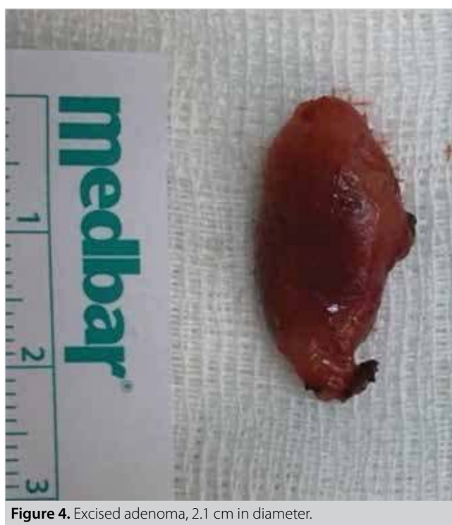
Figure 4. Excised adenoma, 2.1 cm in diameter.

Written informed consents were obtained from the patients for publication of this case report and any accompanying images.