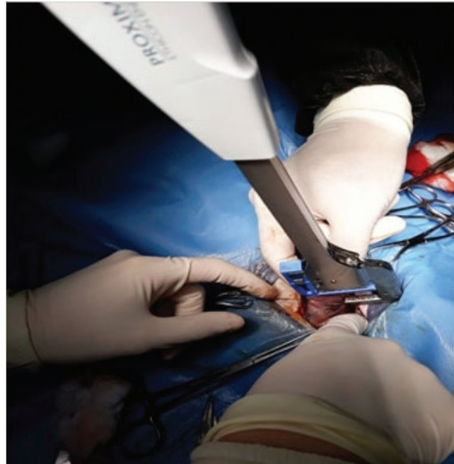
Figure 1. Placement of first stapler and transection of the gastric wall from minor curvature.

The stomach was explored and prepared for transection. The starting point of the stapler was determined as 2-3 cm away from the pylorus (Figure 1). The lesser sac was reached by cutting the hepatogastric ligament at the incisura angularis, the