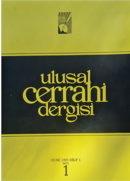
Figure 2. Ulusal Cerrahi Dergisi (Turkish Journal of Surgery): The cover of the first issue (January 1985).