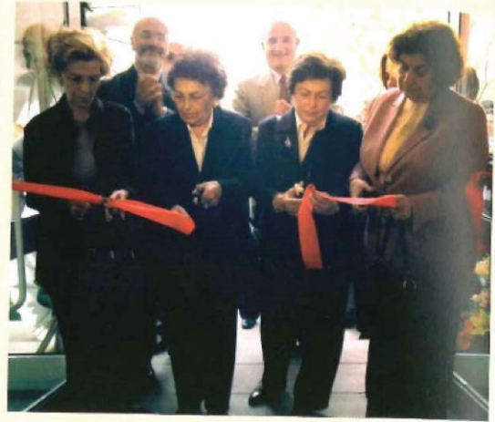
Wives of our late presidents cut the ribbon to open the headquarters.