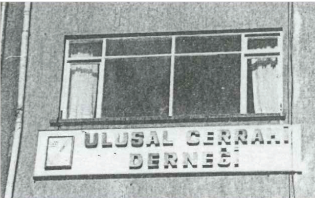
Our first headquarters on Sağlık Street.