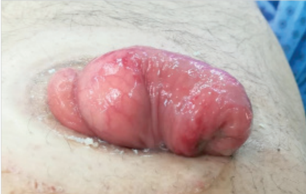
Figure 1. Stoma prolapse observed in sigmoid loop colostomy.

anesthesia was applied around the colostomy. The pressure was applied on the colostomy section protruding from the stoma, and it was sent into the abdomen, and the lumen was checked with a touch. Four 1 cm radial incisions were made around the colostomy, and a circumferential tunnel was created on the fascia around the stoma using these incisions (Figure 2). A silicone vessel tape with a diameter of 5 mm was placed in the tunnel in a double layer surrounding the stoma. In order to prevent the recurrence of the prolapse and not have difficulty in defecation, the vascular tape was adjusted to cover the index finger (new stoma diameter, approximately 1.7 cm) and tied with a silk suture, the skin incisions were closed, and the operation was terminated. Postoperative pain was minimal, and the patient was discharged on the same day, with continued oral nutrition in the form of watery food. The patient had mild abdominal distension and difficulty defecating on the second postoperative day, oral intake was restricted, and the colostomy started to work 48 hours later. No obstruction, recurrence of prolapse, or other complications developed at the 26-month follow-up (Figure 3). The perineum of the patient, who is currently in the terminal period, is in a necrotic state, and a bladder fistula has developed into the wound. However, the patient's oral feeding continues, and the colostomy works well after the revision procedure called the peristomal cerclage .