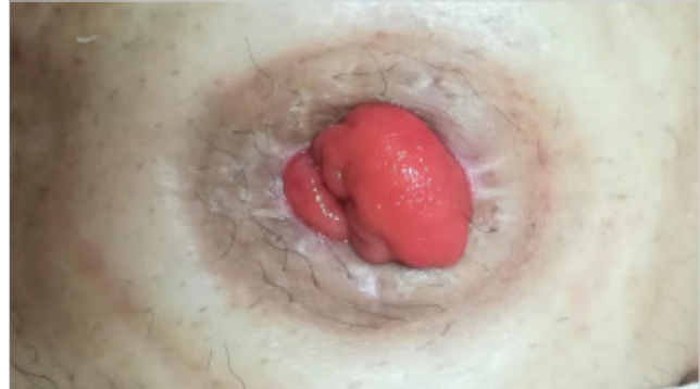
Figure 3. Appearance six months after revision of stoma prolapse.