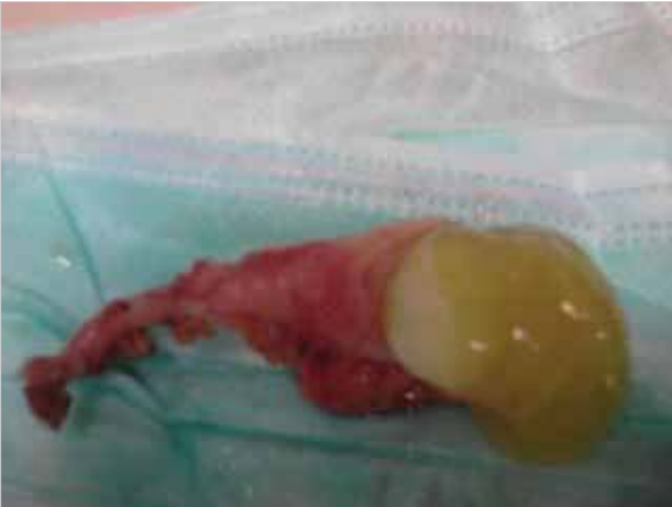
Figure 1. Macroscopic view of the mucocele