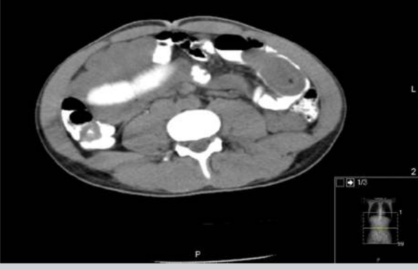
Figure 1. Computed tomography finding of the patient. Ileal intussusception is shown with the white arrow