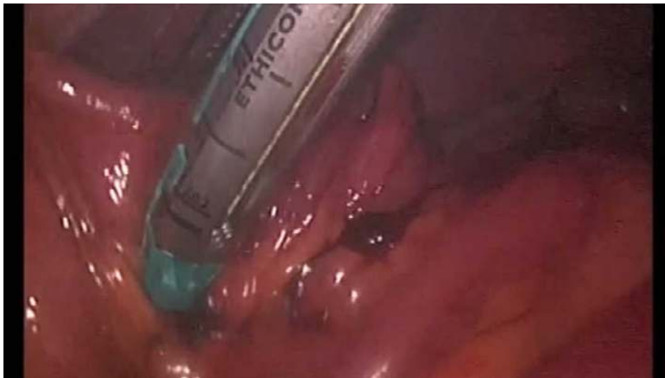
Video 1. Laparoscopic treatment of intussusception