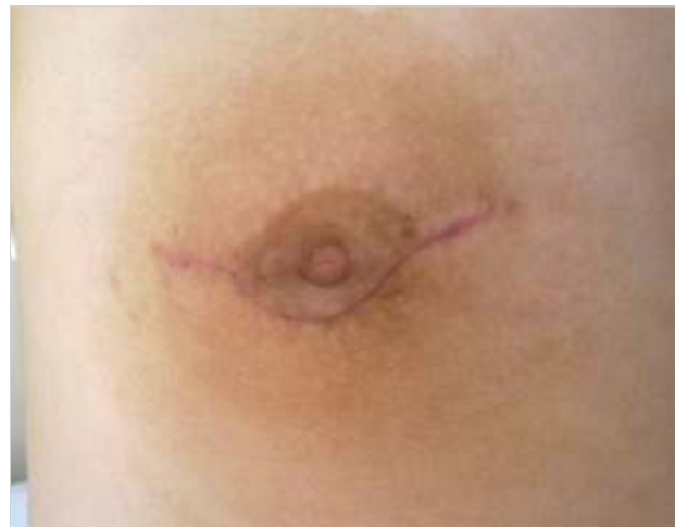
Figure 4. Postoperative view at the 6 th month

Juvenile giant fibroadenomas can influence mammary gland development by the pressure effect due to their enormous