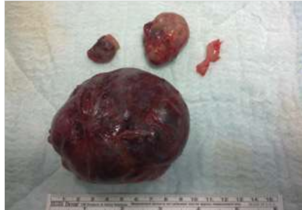
Figure 3. Macroscopic view of the excised giant fibroadenoma specimen