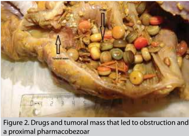
Figure 2. Drugs and tumoral mass that led to obstruction and a proximal pharmacobezoar

and a wound infection, for which he was treated with suitable antibiotics and wound dressings.