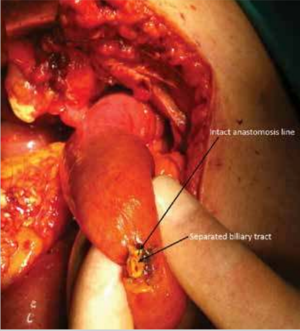
Figure 2. The bile duct was ischemic

be ligated, dissected, or cut and reconstructed in cases of tumor infiltration (4). Vascular injury, especially of the hepatic artery, may still occur during PD in the absence of any vascular anomalies. As seen in our case, the site of injury can affect the repair and the result. It has been shown that injury of the hepatic artery mostly occurs at the level of the proper hepatic artery (5).