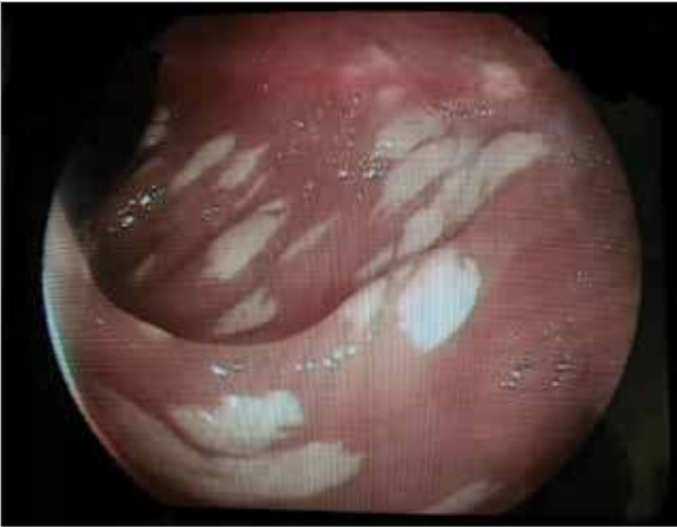
Figure 1. An endoscopic appearance of colonic pseudolipomatosis