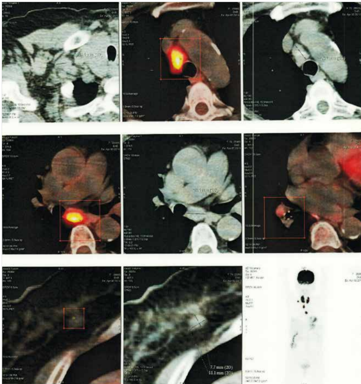
Figure 1. Positron-emission tomography/computed tomography showing intense uptake mediastinal lymphadenopathies and right breast mass

mastectomy was performed instead of the technique offered above. The surgery was completed without any complication. The specimen size was 1.4 cm, and the pathological result was invasive ductal carcinoma that was estrogen receptor positive, progesterone receptor negative, and HER2 negative. Axillary dissection was performed; 14 lymph nodes were dissected and all of them were negative. The patient was discharged on the third postoperative day. No additional application was suggested except 1 mg of anastrozole daily for 5 years. The patient was informed and written consent was obtained.