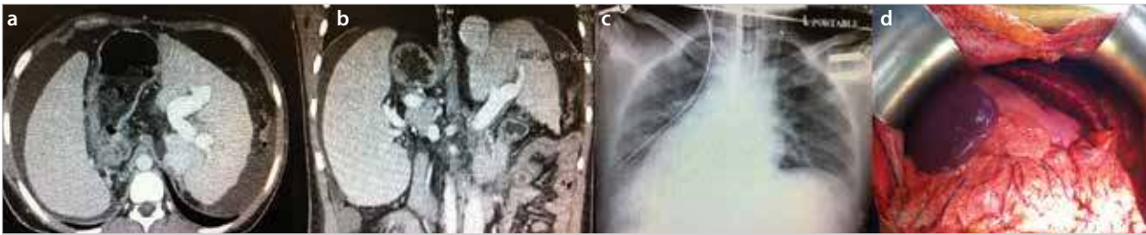
Figure 1. a-d. Preoperative and perioperative findings of the recipient. (a) Preoperative horizontal CT image showing SIT. (b) Preoperative coronal CT image showing SIT. (c) Preoperative thorax X-ray image showing dextrocardia. (d) Perioperative abdominal view of the recipient showing SIT CT: computed tomography; SIT: situs inversus totalis