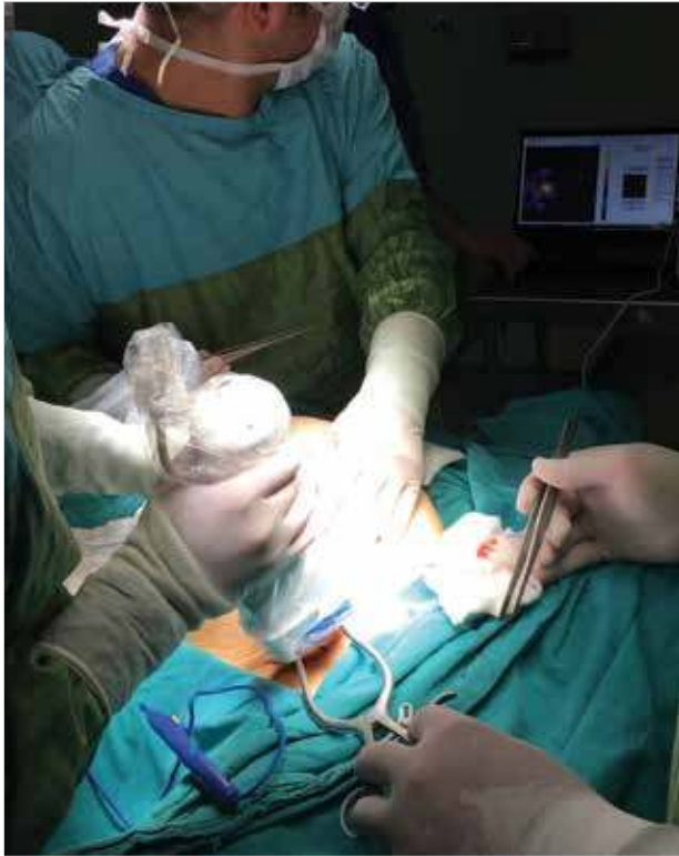
Figure 1. Exploration of sentinel lymph node using portable gamma camera