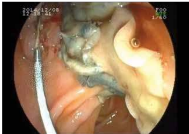
Figure 4. Extraction of Fasciola hepatica using a balloon catheter