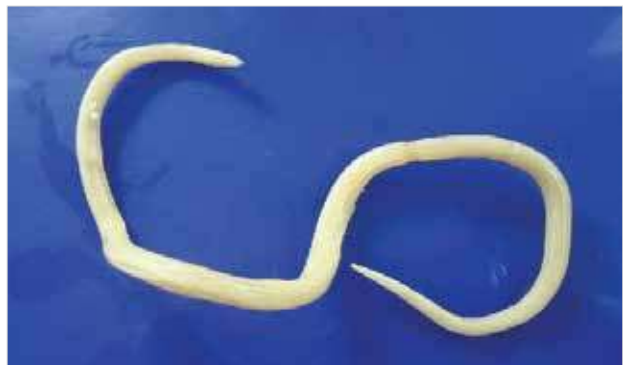
Figure 5. Ascaris lumbricoides extraction from the bile duct during emergency laparotomy