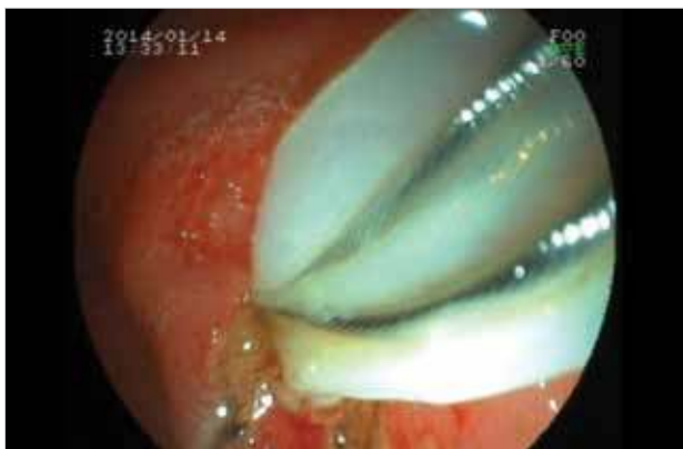
Figure 2. Germinative membrane extraction using a basket catheter