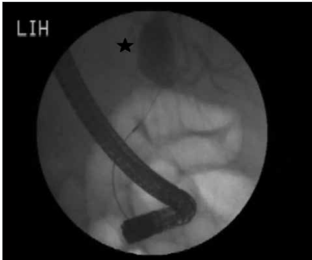
Figure 1. Cyst pouch of Echinococcus granulosus on cholangiography

Endoscopic retrograde cholangiopancreatography is an effective and reliable method for the treatment and differential diagnosis of various parasitic diseases involving the biliary system. Of these, the daughter vesicles and/or germinative membranes of E. granulosus are the most frequent cause of