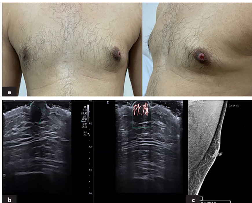
Figure 1. Clinical and radiological images of nipple adenoma. a) Hyperemia and serous discharge in the left nipple. b) On ultrasonography, the volume of the left nipple has increased and is 6x9 mm, the skin-subcutaneous tissues are eroded, with the central nipple showing a hypoechoic appearance with a diameter of 2.2 mm, suggesting a dilated duct with dense content in the foreground. c) In mammography, there are no findings other than prominence in the left areola.

Nipple adenoma is a rare benign condition that can be confused with Paget's disease of the breast (8). However, it can be confused with malignant lesions and although rare, some publications mention its association with carcinoma (9). In addition, as with other breast lesions, almost all adenomas are seen in women. This makes clinical suspicion difficult in male patients. In the nipple adenoma, which was first described in 1973, in the study published in 1986, consisting of 51 cases, which is still the largest case series known on this subject, in the study published in 2010, 19 cases encountered over 14 years were described, in the study published in 2014, 13 cases were presented, and in studies where 11 cases in 2021 and 12 cases in 2022 were presented, the patients are almost exclusively female (4,6,7,10-12). Finally, in 2023, Weigelt et al.'s (13) 50-case study, which revealed their 20-year experience and is the largest nipple adenoma series published to date, also included female patients only. Although it is stated in this and many similar publications