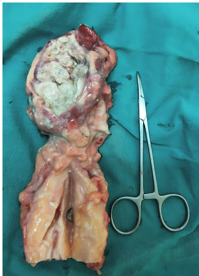
Figure 3. Simple nephrectomy specimen of a pyonephrotic kidney due to a mid-ureteric calculus. Significant intraoperative perinephric adhesions were encountered. Note the thickened walls of ureter secondary to periureteritis caused by obstruction.

the parenchyma, and thus causes a reduction in the bacterial burden. Additionally, renal function can return with the control of sepsis. Although the exact pathogenesis of pyonephrosis has not been extensively studied, obstruction and superimposed bacterial infection are considered the two main etiologic factors. Studies have shown that higher degrees of HN directly correlate with the development of pyonephrosis. This is due to increased intrapelvic pressure, which reduces urine production and predisposes the kidney to retrograde bacterial infections (19). With increasing grades of hydronephrosis, parenchymal thickness of the kidney decreases. The parenchymal thickness in a normal kidney is 15-20 mm. Reduced parenchymal thickness adversely affects the recoverability of renal function post-PCN placement. Some studies have shown that a parenchymal thickness <10 mm is associated with non-recoverability of renal function. Our study corroborated this finding, that patients with severe grades of HN had lower odds of recovering renal function post-PCN insertion. Several other factors, such as age, sex, and hemoglobin level, have been found to affect the recoverability of renal function (5,20,21). Males have been found to have a