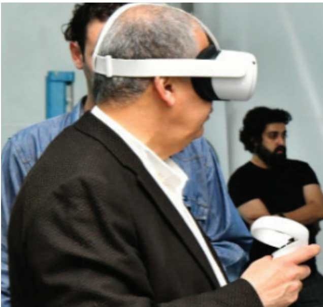
Figure 7. An example of a surgical application using a VR headset.

Zoltan Takats of Imperial College London created the intelligent surgical knife (iKnife), which combines real-time mass spectrometry and electro-surgical dissection. The chemical makeup of the tissue that is vaporized during incision is instantly examined, enabling the surgeon to make an immediate distinction between benign and cancerous tissue. By converting