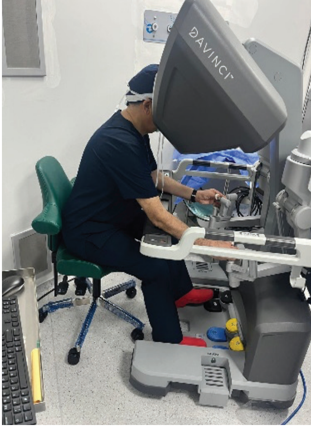
Figure 3. Robotic surgery in our operating room.

An important turning point in the delivery of digital healthcare was reached when our hospital was the first in Türkiye to employ WhatsApp for video-based medical consultations, reviewing their data through our hospital's electronic records and software