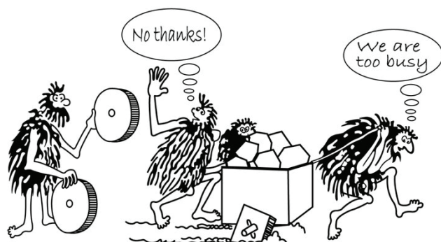
Figure 1. Throughout history, people have worked for change, yet they have also shown resistance to it. ( https://www.google.com/url?sa=i&url=https%3A%2F%2Ftr.pinterest.com%2Fouido%2F&psig=AOvVaw2eJXLV1zZ6ih7Z8dmM8Jhz&ust=1753787763837000&source=images&cd=vfe&opi=89978449&ved=0CBEQjRxqFwoTCjK4Nq2344DFQAAAAA dAAAAABAz )

Science fiction has been a literary genre that pushes the boundaries of human imagination for over 200 years. In technologically advanced cultures, writers have always conjectured about what doctors and surgeons could be capable of. Surprisingly, science fiction has frequently been a prophetic medium, foreshadowing advancements in medicine. Robotic