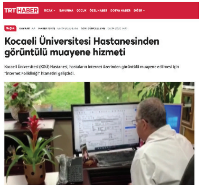
Figure 5. A first in Türkiye: video consultations with patients via WhatsApp in our hospital.

The use of self-operating robotic equipment, the "MEDPOD", by Elizabeth Shaw to execute an open abdominal treatment and remove an alien organism is a noteworthy cinematic example of autonomous surgical intervention in the film Prometheus