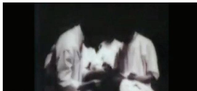
Figure 2. A scene from what is believed to be the oldest film depicting a surgical procedure, dated 1899 (2).

This pattern has been confirmed by developments since the 1970s. Notably, telehealth became an essential tool for sustaining medical care during the coronavirus disease-2019 (COVID-19) epidemic, much like virtual education did in terms of maintaining continuity in the face of worldwide upheaval (7).