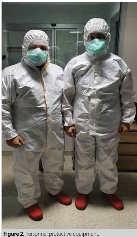
Figure 2. Personnel protective equipment.

During the laparoscopic surgery, the incisions made for the ports should be as large as the instruments can pass and are small enough not to allow gas leakage. If the first trocar is placed by open Hasson technique, the purse string suture should be made around the first trocar in order to prevent gas leak. Intra-abdominal CO 2 insufflation pressure must be kept to a minimum level. Ultrafiltration (smoke evacuation system or filtration) should be used if it is available. Filtration system should be used to safely discharge intra-abdominal gas.